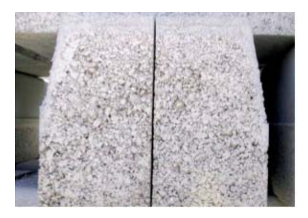
Without M-Cast 64