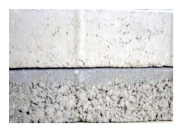
With and without M-Cast 64

A dosage of 0.3%, 5 fluid oz per 100 lb cement weight is recommended. Under such conditions, the water content in the initial concrete formulation is increased by 15%. The M-CAST 64 is conventionally introduced in the concrete mixer with the dry raw materials. The high alkalinity of the concrete activates the thixotropic behavior of M-CAST 64.