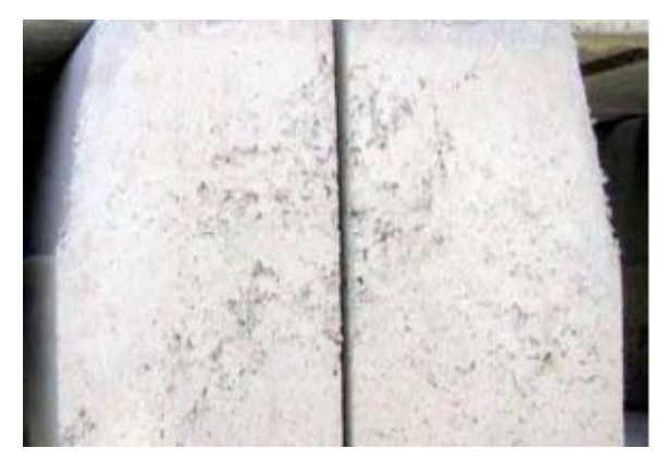
With M-Cast 64